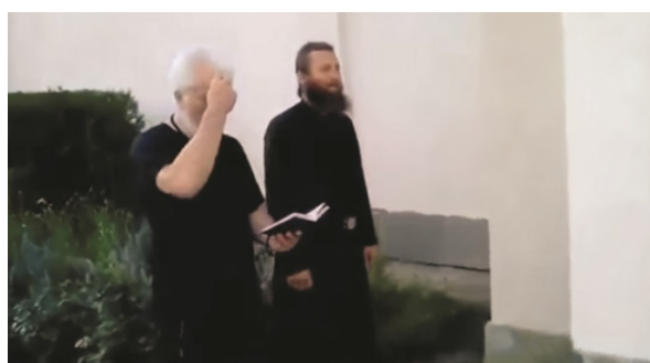
Snap shots from the video made available by the illegal pro-Russian combatants of NONA-C systems firing from the Kind News church property (left) and the prayers of Orthodox priests which accompanied this (right), Sloviansk, June 2014